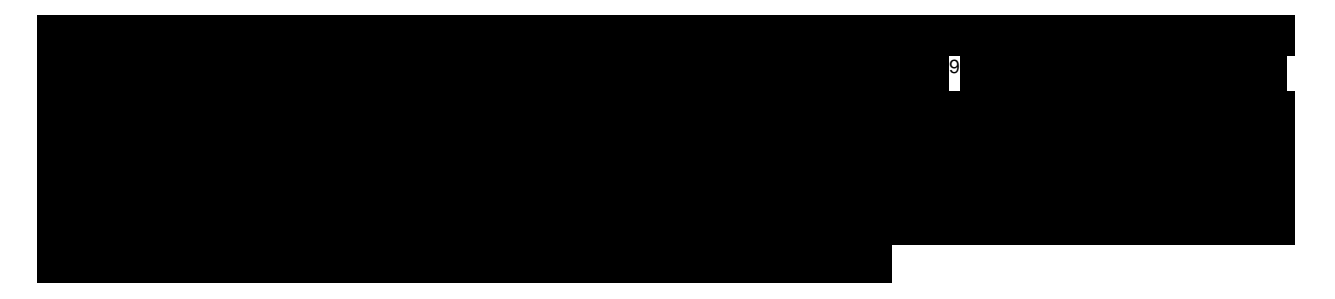
Issue 2. § 351.

In the instant case, CorpA acquired the CorpG Stock from CorpC in a § 351 transaction, and therefore CorpA's basis in the CorpG Stock was determined by reference to CorpC's basis. Accordingly, § 269(a)(2) may apply unless CorpA (as the acquirer) or its shareholders controlled, directly or indirectly, CorpC (the transferor) immediately before the transfer of the CorpG Stock.<sup>8</sup> In addition, of course, the application of § 269(a)(2) would require a showing that the principal purpose of CorpA's acquisition of the CorpG Stock was the evasion or avoidance of tax by securing the benefit of offsetting the gain on the CorpG Stock against CorpB's expiring NOLs.