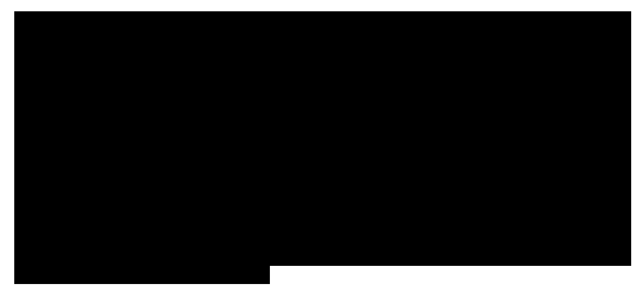
Please call if you have any additional questions regarding this memorandum.